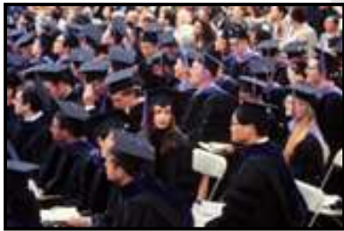
Picture Yourself Here a Few Months From Today!

Now ... where among Triad colleges can you beat this package of features? You can't. So enroll now with the Admissions Application on our website — or contact us for a personal discussion of how you can advance your career.